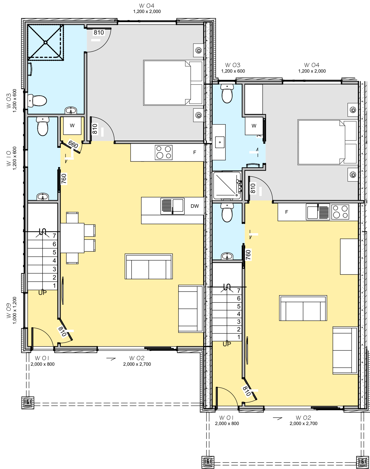
Type '2' Unit, Ground Floor Type '3' Unit, Ground Floor