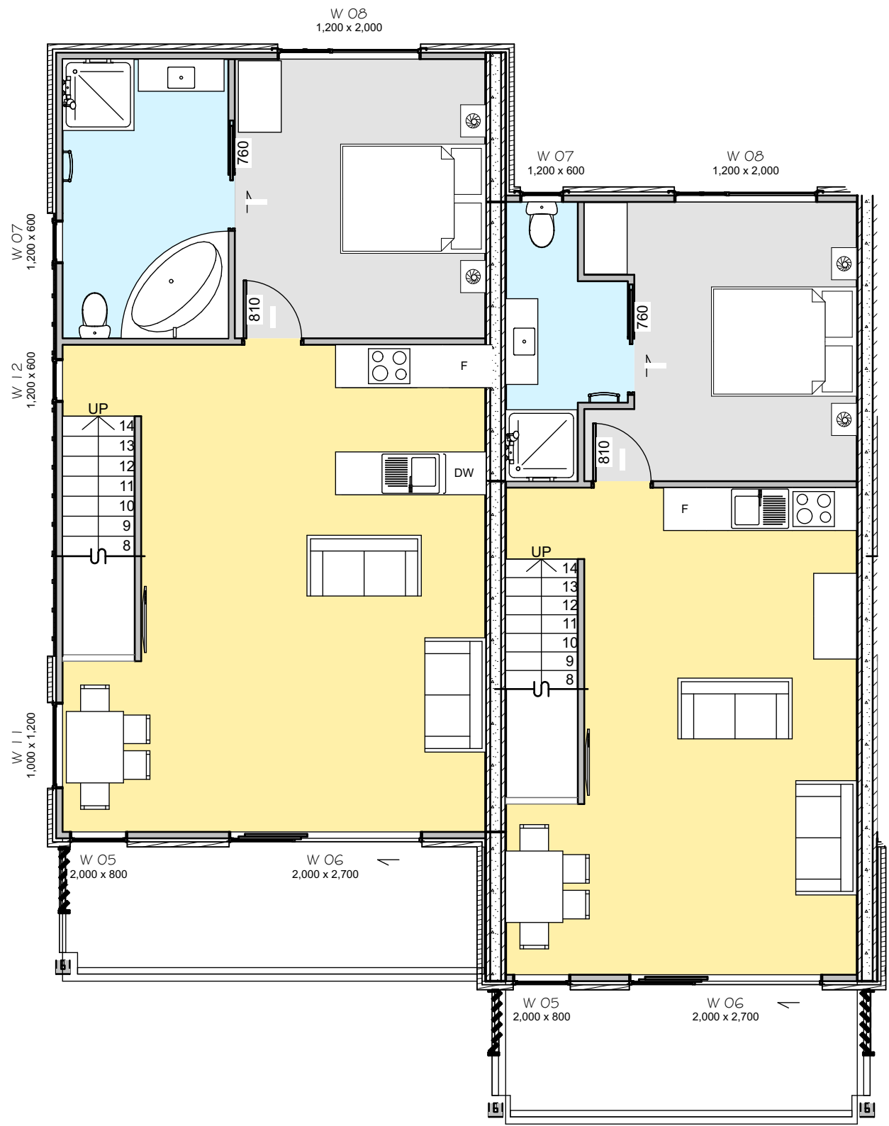
Type '2' Unit, First Floor Type '3' Unit, First Floor